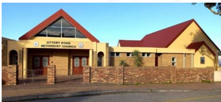
A current picture of the Ottery Road Methodist Church.