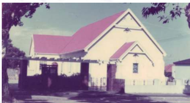
A picture of the Ottery Road Methodist Church in Wynberg, in 1972.

For more information, contact Mr Hadskins on 082 582 1575.