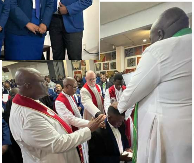
Below: The Act of Induction