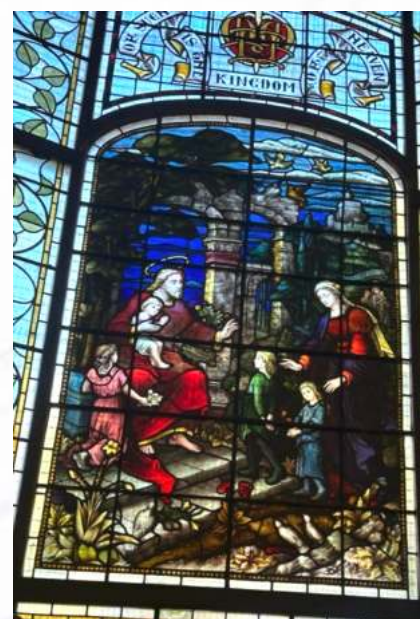
The magnificent stained glass window depicting Matthew 19:14 "Let the children come unto me..." at Marsh Memorial Homes