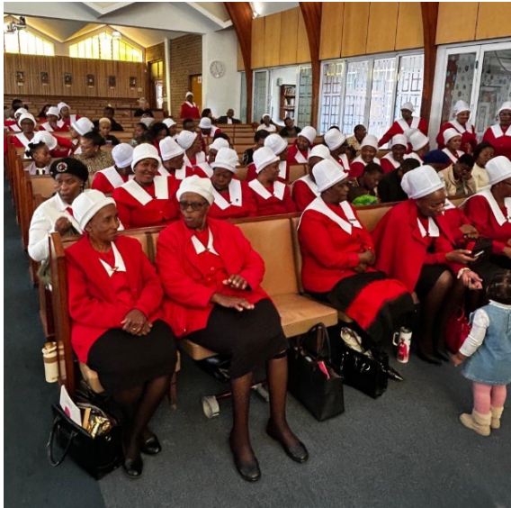
Above are the newly robed ladies, together with the JHB North 0903 circuit. Below are all the teams preparing for the festivities.