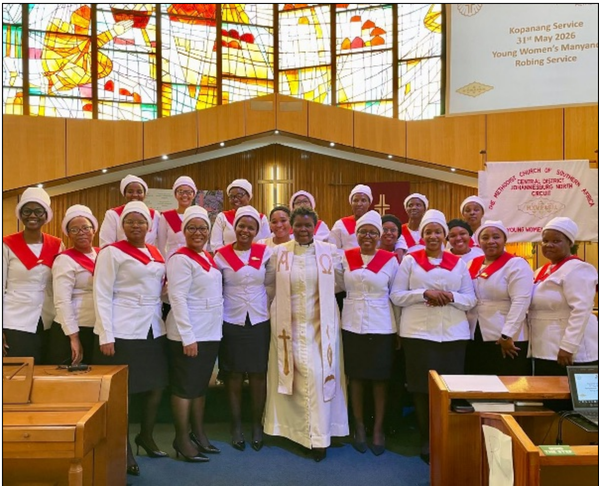
Our Young Womens' Manyano and Junior Manyano had their robing ceremony – where they were welcomed into full membership – at the Kopanang Service on Sunday 31 May.